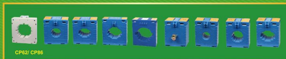
CP62 / CP86